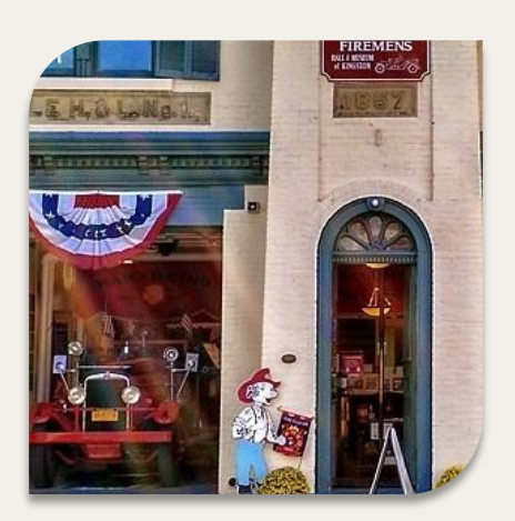
Volunteer Firemen's Museum 265 Fair Street, Kingston