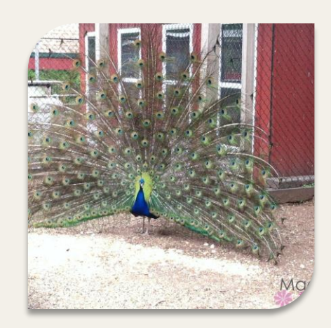
Forsyth Nature Center 125 Lucas Ave Ext, Kingston