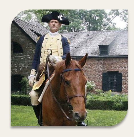
Senate House State Historic Site 296 Fair Street, Kingston