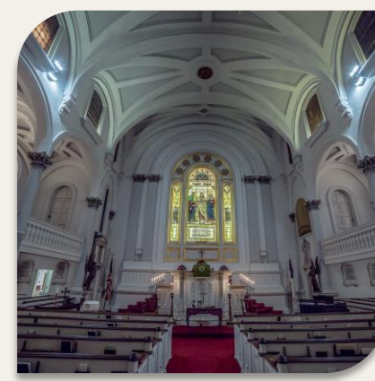
Old Dutch Church 272 Wall Street, Kingston