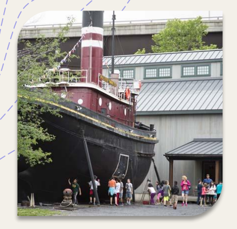
Hudson River Maritime Museum 50 Rondout Landing, Kingston